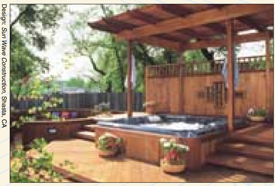
Sheltered spa structure . A bubbling spa is built into a multi-level, knot-textured deck. Design elements include a soaring shade trellis and a privacy screen with an intricate cutout pattern.