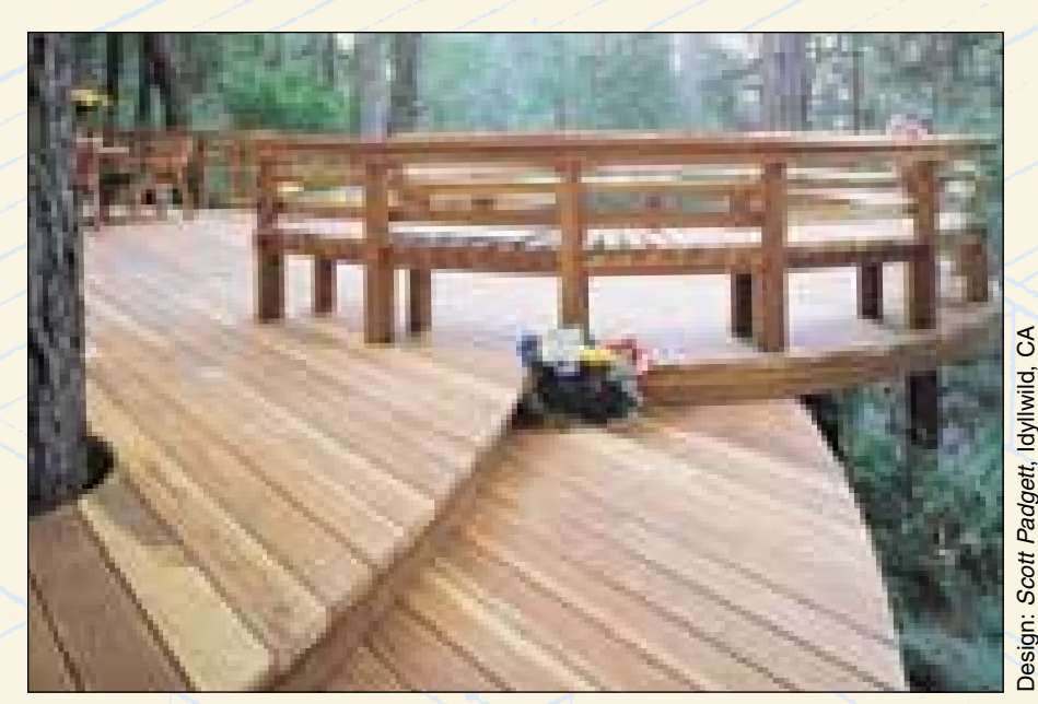
Sculptured mountain deck. Sapwood-streaked, Clear grade rounded deck includes five levels. A wooded sloping site dictated the profile. A circular built-in bench cantilevers over a creek.