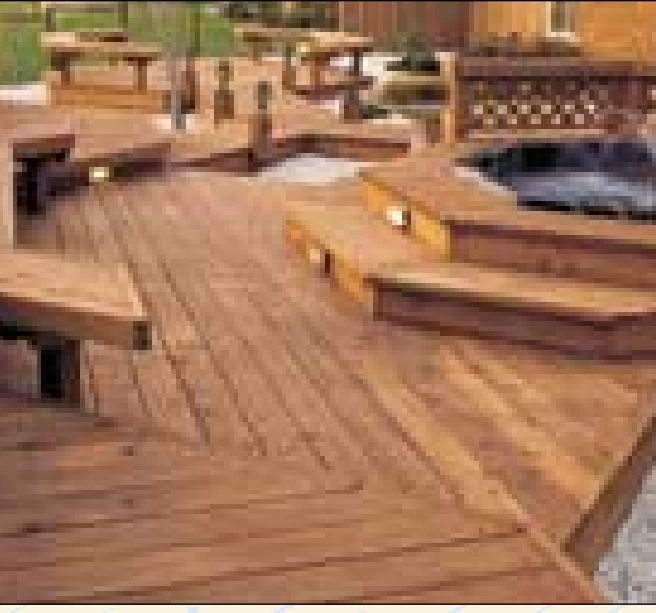
Angular sectional deck. Construction Heart/Deck Heart segments are joined by walkways. A focal point is an artful fountain and spa. Lattice railings and inviting built-in benches complete the design.