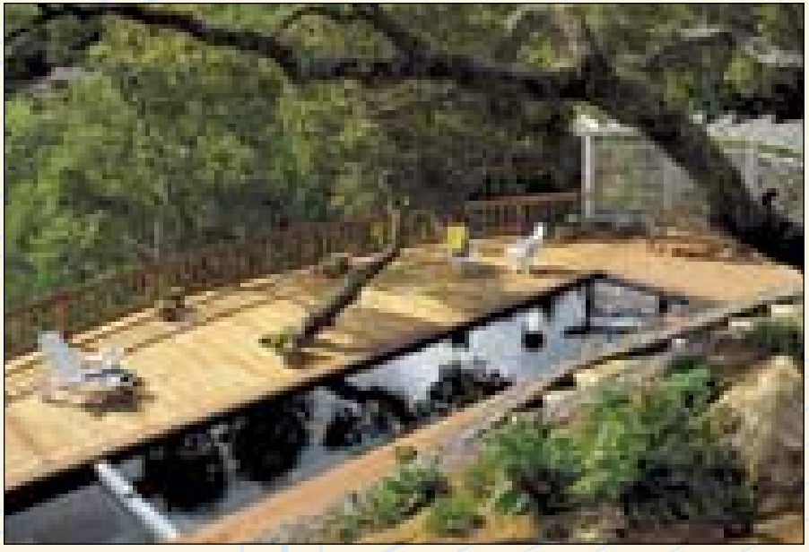
Curved lap pool deck. A combination of Construction Heart/Deck Heart redwood and brick surrounds a black-bottomed lap pool and hot tub. A semi-circular privacy trellis screens the pool from a nearby street. An existing oak tree was incorporated into the design, adding shade and reflections.