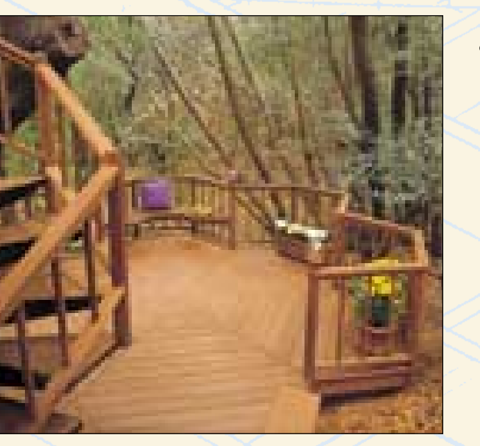
Geometrical tree-shaded deck. Inviting deck features a spiral staircase and six-sided contour. Concentric deck patterns and built-in benches as well as planters with the hexagonal theme add to the setting.