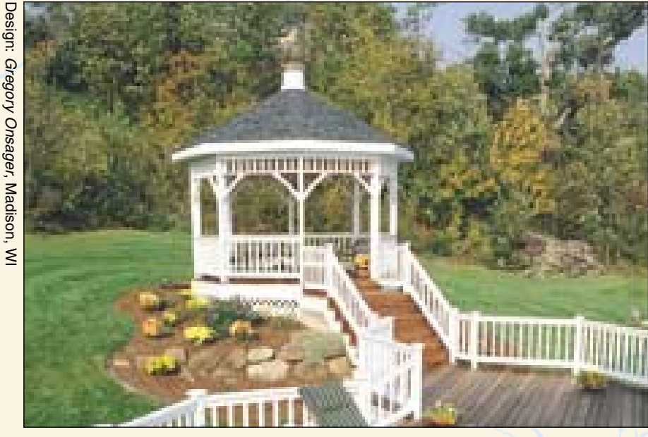
Romantic gazebo and deck. A nostalgic 12-foot diameter octagonal gazebo rests on a pod attached via a staircase from a deck addition. Gazebo elements, understructure and railings were painted a crisp white for extra eye appeal.