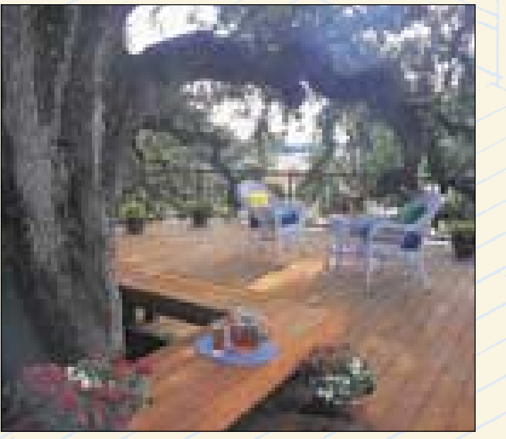
Deck-around-a-tree. An existing oak is the centerpiece of a multi-level garden grade structure. A bench surrounding the tree, wrought iron railings and built-in lighting are other features.