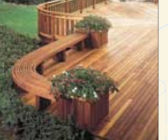
Curved deck with amenities. Handsome deck features an appealing curved bench flanked by built-in planters. The decking was installed in a herringbone pattern.