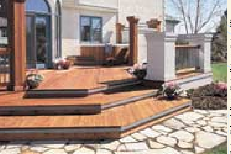
Modern transitional addition. Handsome three-tiered Construction Common/Deck Common deck features imposing stucco columns and steel railings. Accents are designed and color coded for greater integration with the house.

rado Custom Decks, Colorado Springs Color