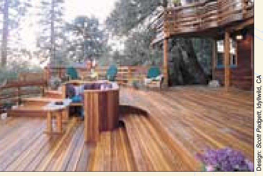
Spacious contoured deck. Multi-level Clear grade deck includes built-in seating, intricate railings and an inviting balcony. Using outstanding craftsmanship, intriguing multiple curves were incorporated into the deck shape, level changes, railings, bench and upper-story deck.