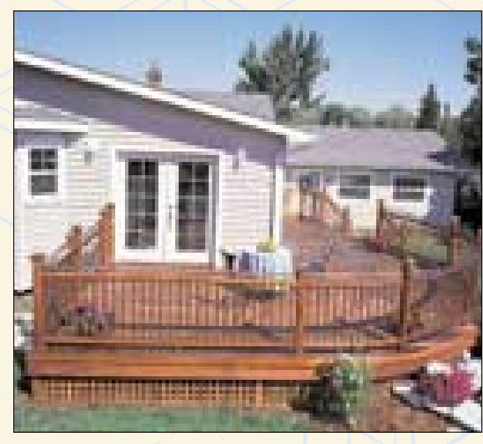
Graceful redwood-and-copper-railed deck. Elements of this simple, but elegantly detailed, knotty deck include a gently rounded shape and redwood and copper pipe railings. Redwood lattice screens the underside of the deck.