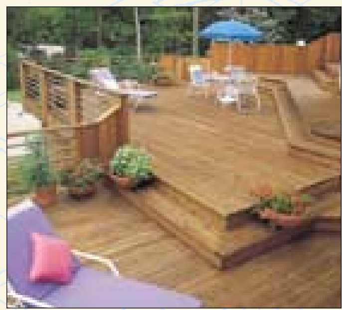
Striking ultra-contemporary deck. Slender 2x4 knotty decking was placed in alternate directions to highlight graceful level changes. Brushed stainless steel rails add a modern tone.