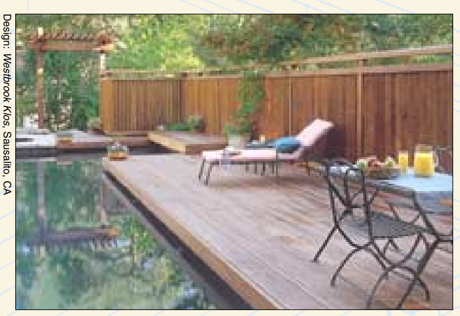
Louvered poolside privacy screen. Graceful, seven-foot-high redwood fence screens a pool from surrounding houses. The pool also features a multi-level redwood deck that appears to float at its edges. Fence boards were louvered to allow views of the landscape while creating a property line barrier.

Today's redwood fences are functional yet elegant. The variety of design options available enables a homeowner to create a structure that is truly tailor-made to the site. By softening sounds and providing a barrier to wind and sun, a fence can increase the pleasure of outdoor living. A redwood fence also contributes to a home's overall ambiance, appearance and value.