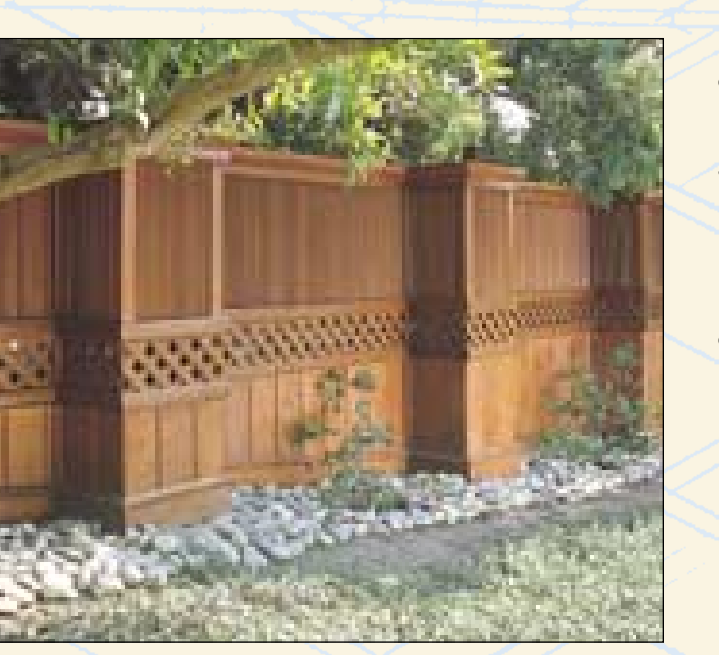
Handsome columned fence. Intricate design consists of tongue and groove boards topped by a strip of redwood-ribboned lattice and then by louvers which are set at a 45^{\circ} angle.