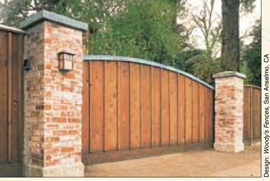
Construction Heart security fence. Simple, yet elegant board and batten driveway gate has a graceful arched shape. Top is trimmed with copper. Brick columns topped with copper capitals flank the gate and provide an imposing sense of arrival.