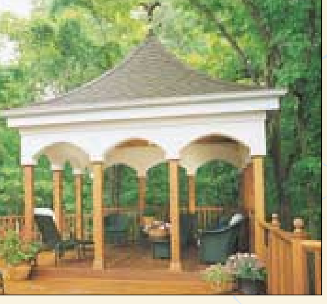
Pagoda deck shelter. Construction Heart deck is enhanced by a pagoda-like gazebo. The structure is characterized by eyecatching curves and arches and includes a ceiling fan and antique weathervane.