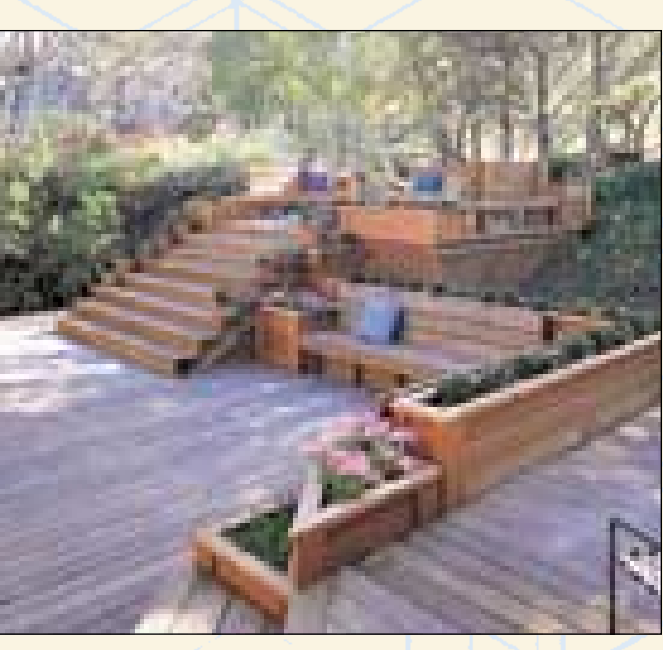
Multi-level deck. Extensive backyard project includes a platform built into a slope in the yard. Elements encompass built-in benches and planters, a staircase and lattice understructure screening.

rado Custom Decks, Colorado Springs Color