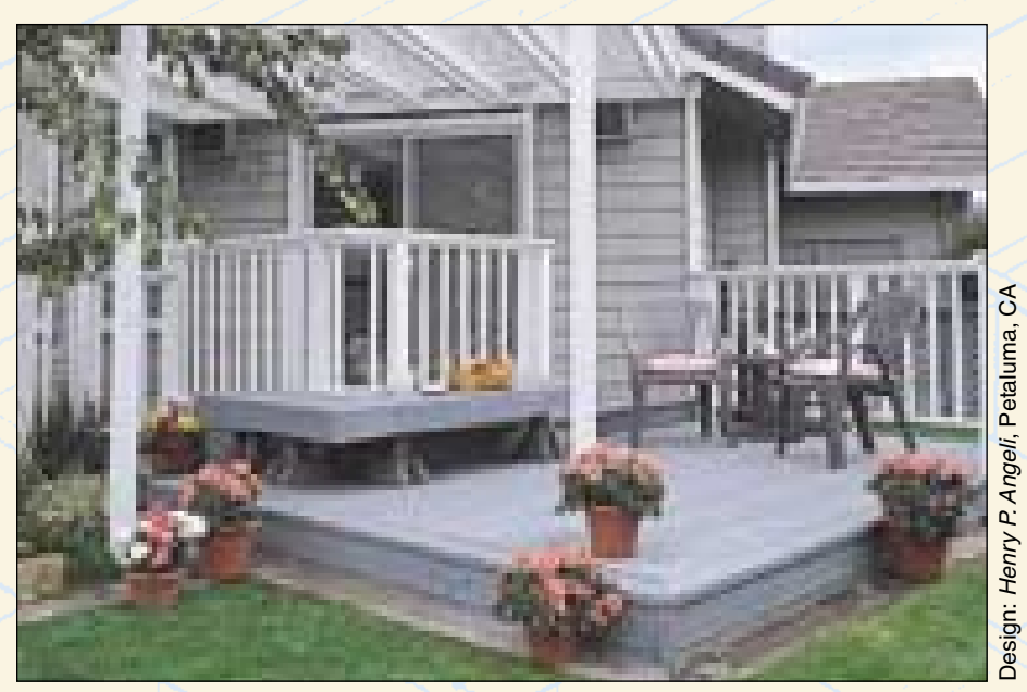
Color-keyed deck addition. Multi-level Construction Heart/Deck Heart project includes an inviting shade shelter. White railing and trellis and grey decking blend with house colors to create a seamless transition.