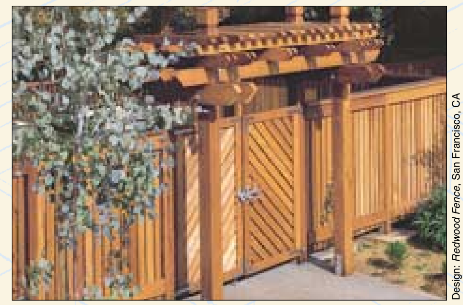
Inviting gate with trellis. A soaring multi-layer canopy tops this sapwood-laced fence and gate. The ends of the trellis boards were artfully shaped to add design interest. The double gate boards were placed diagonally to create an eye-catching entry.