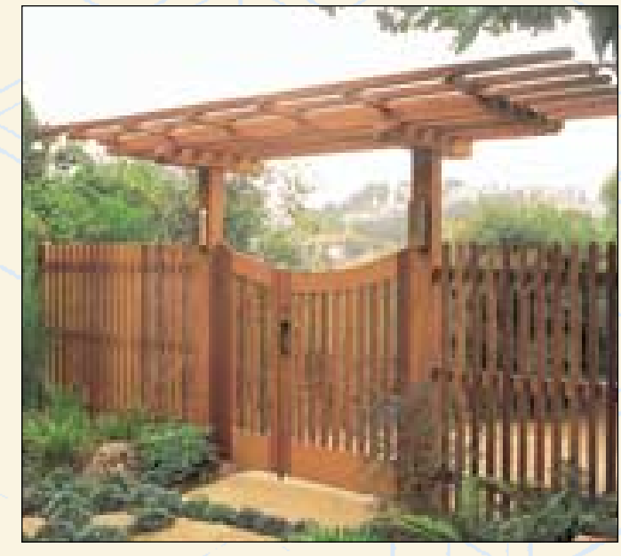
Japanese-style entry . A fence, sturdy iron-hinged entry gate and copper-clad portal beams and trellis elegantly transform open space from curb to front door.