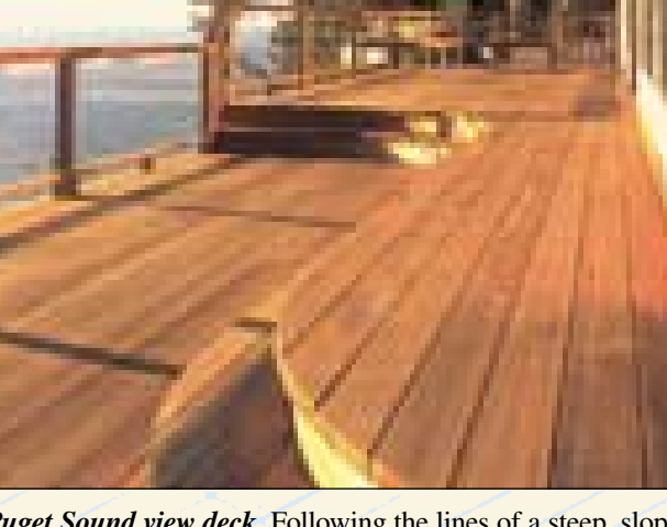
Puget Sound view deck. Following the lines of a steep, sloping site, this expansive deck flows down via curved steps. Panels of tempered safety glass screen wind without obstructing spectacular views.