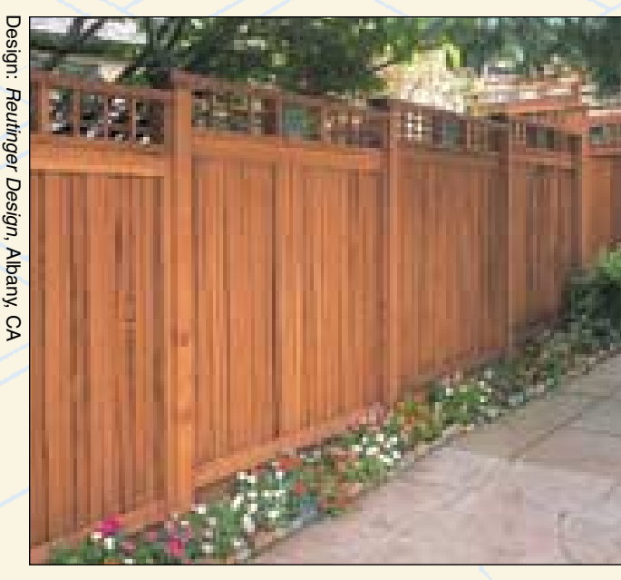
Grapestake sculpture fence. Elegant six-foot-tall grapestake fence flows in sections up a sloping site. Grillwork panels punctuated with whimsical inserts of metal snake sculptures cap the structure.