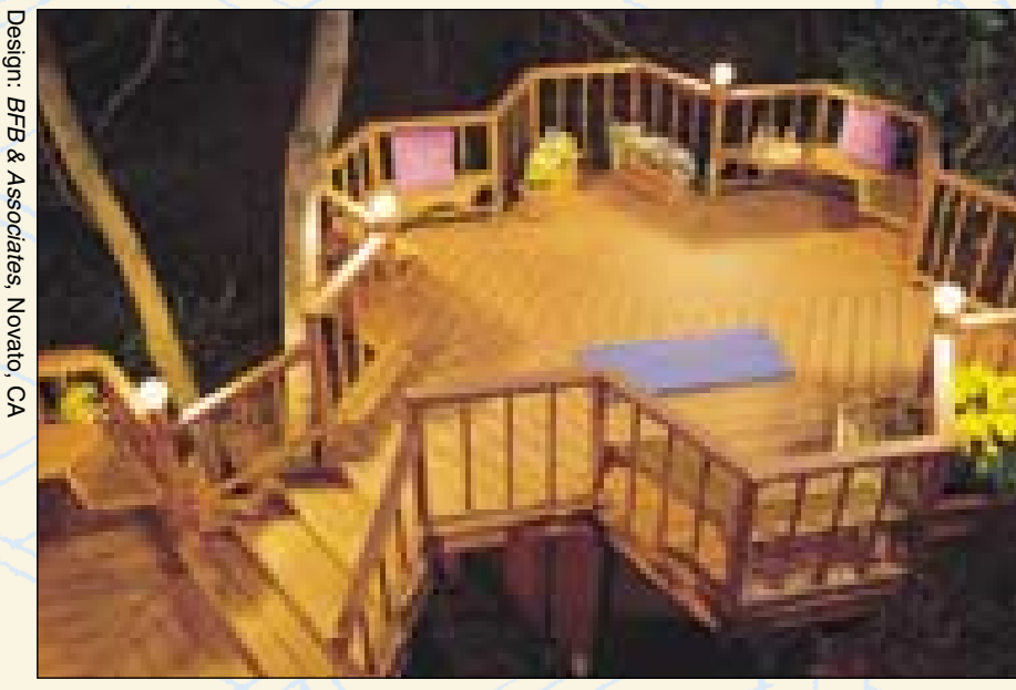
Six-sided modular hillside deck. Striking hexagonal deck includes built-in lighting. Using remarkable craftsmanship, the decking, benches and railings were all shaped using the six-sided format.