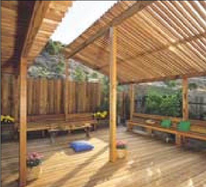
Deck and angular trellis addition. A Construction Common deck is enhanced by a shady set of twin trellises with a sloping design. Built-in benches and redwood fence complete the attractive setting.