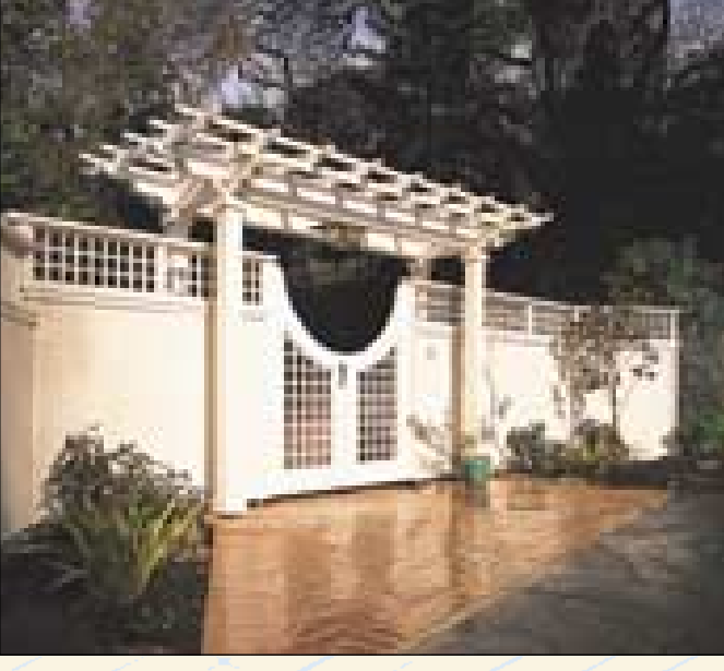
Entry gate/pergola/fence. Inviting entryway includes a lacy latticed and curved gate topped by an imposing layered pergola. A fence with matching latticework provides privacy and security.

The most successful redwood gates create a sense of arrival and anticipation. A gate is the first thing a visitor encounters and sets the tone for the property. Some gate solutions are basic, blending with a fence or surrounding landscape. Others are ornamental and may be framed with a canopy or arbor to create a natural and pleasing portal.