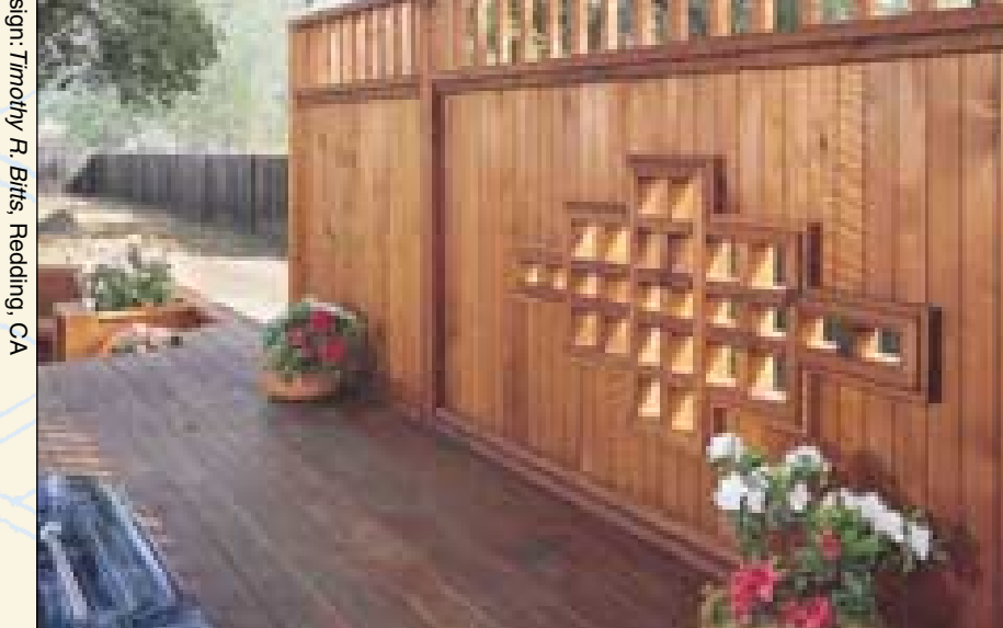
Eye-catching privacy screen. Part of an overall redwood deck project, a Construction Heart/Deck Heart fence shields a spa setting from neighboring yard. The intriguing design includes sculptural cutouts and top trim of redwood uprights.