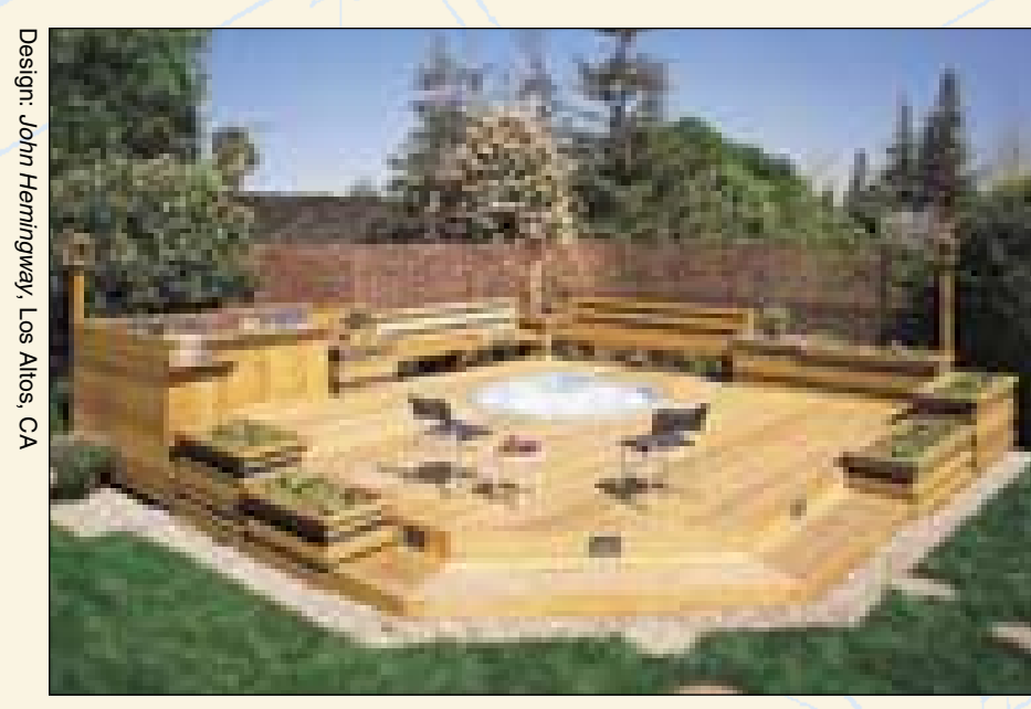
Angular party deck. Designed for entertaining, this freestanding deck includes sunken spa, outdoor kitchen, eight-foot lattice fence and built-in benches and planters. Ceramic tile is a colorful accent.