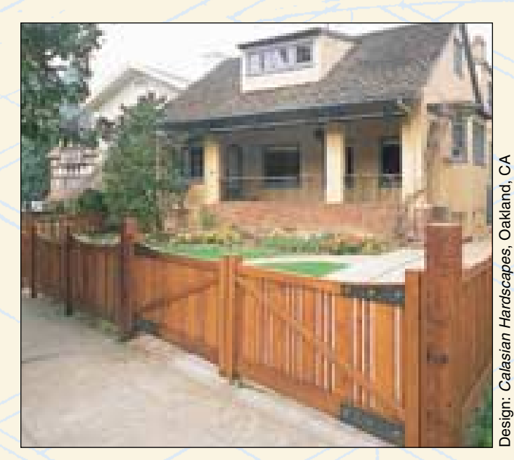
Craftsman-style property line fence. Fence and driveway gate include upper railings styled in a concave shape and alternating sizes of upright fence pickets. Iron strap hinges were handmade.