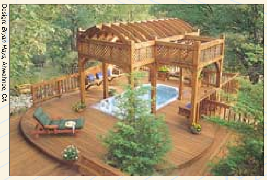
Imposing deck and pavilion. A curved Construction Heart/Deck Heart platform encases a swim-in-place pool. A soaring redwood shelter featuring arches and lattice accents dramatizes the project. Built-in benches and planters and sturdy safety rails complete the inviting setting.

Amidst the stress of the modern world, redwood outdoor structures are an increasingly popular addition to a deck, garden or backyard setting. They are delightful places to retreat from the world, enjoy the garden, read a book or entertain friends. The sensation of being in an open, but sheltering structure is soothing and relaxing.