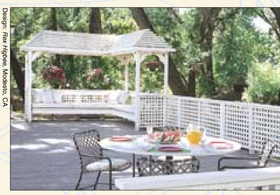
Corner bench deck shelter. L-shaped bench transforms a bare corner of a deck. The 9x9 structure has a hip roof that creates a shady retreat. Classic redwood lattice panels form the back of the bench, echoing adjacent deck railings.