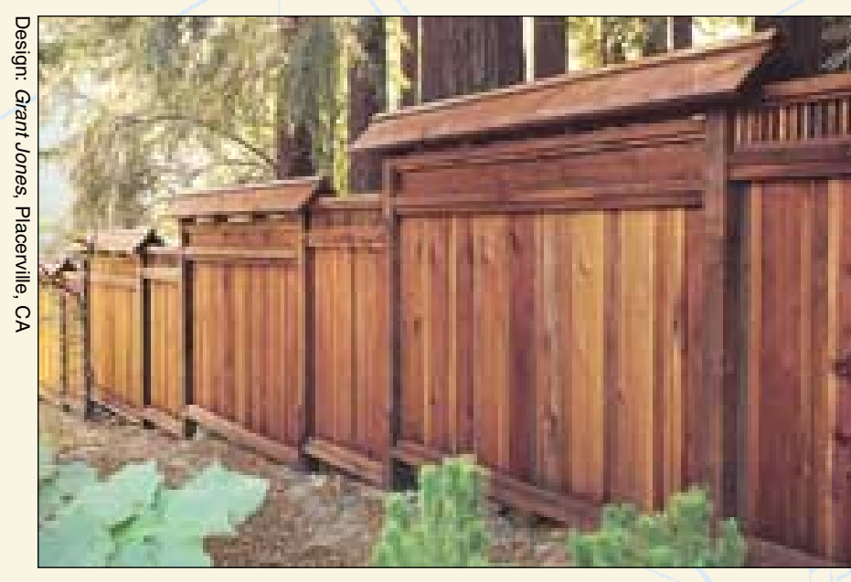
Gabled hillside fence. A series of Construction Heart/Deck Heart panel modules are stepped along a sloping site. Intriguing fence top design consists of alternating inserts of uprights and gabled roofs.